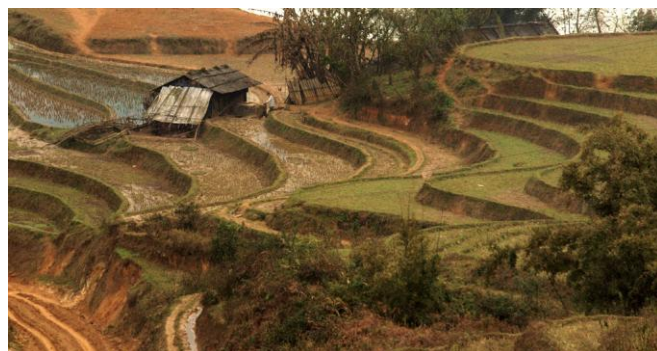
Photo: Sapa Paddy Fields